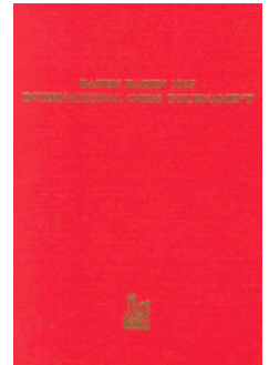
Baden Baden 1925 by Jimmy Adams

Purchases from our shop help keep ChessCafe.com freely accessible: