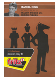
Power Play 09: Major Pieces vs. Minor Pieces by Daniel King