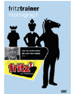
My Life for Chess Vol. 1 by Viktor Kortchnoi

Purchases from our shop help keep ChessCafe.com freely accessible: