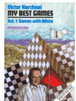
My Best Games, Vol. 1 by Viktor Kortchnoi