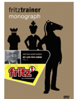
My Life for Chess Vol. 2 by Viktor Kortchnoi