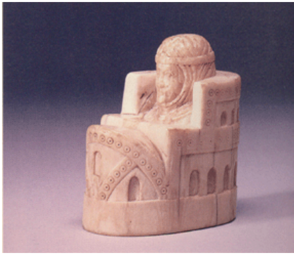
Romanesque chess queen packaged within a throne-lie structure. Spain, twelfth century.