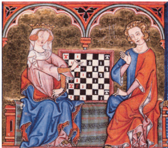
Queen Arabel teaching Willehalm to play chess. The Willehalm Codex, Germany, 1334.

One of the most powerful queens in the history of the world who may have been the impetus in changing the power of the chess queen into what she is today was Queen Isabella of Spain, herself a chessplayer. The author suspects that the chess queen's rise to prominence was a response to the real-life Isabella, a monarch so powerful that when proclaimed queen of Castile and Leon, she didn't bother to inform her husband, King Ferdinand, until after the ceremony.