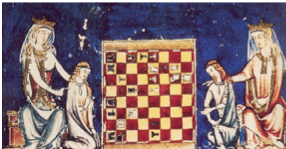
Queens teaching their children to play chess. Alfonso's Book of Chess, Spain, 1283.