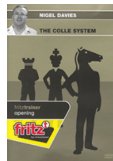
The Colle System by Nigel Davies