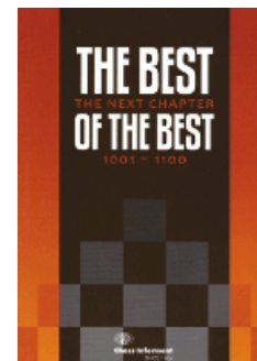
The Best of the Best: The Next Chapter by Chess Informant