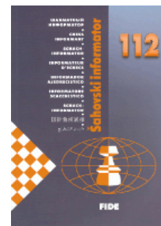
Chess Informant 112 by Chess Informant

Purchases from our chess shop help keep ChessCafe.com freely accessible: