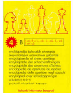
ECO B by Chess Informant

Purchases from our chess shop help keep ChessCafe.com freely accessible: