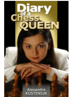
Diary of a Chess Queen by Alexandra Kosteniuk

Purchases from our shop help keep ChessCafe.com freely accessible: