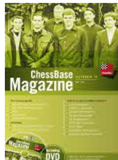
ChessBase Magazine 144 by Rainer Knaak