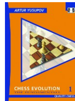
Chess Evolution 1: The Fundamentals by Artur Yusupov