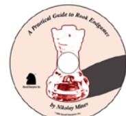
A Practical Guide to Rook Endgames (CD) by Nikolay Minev