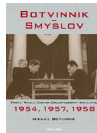
Botvinnik-Smyslov by Mikhail Botvinnik

Visit Shop.ChessCafe.com for the largest selection of chess books, sets, and clocks in North America: