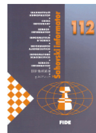
Chess Informant 112 by Chess Informant

Purchases from our chess shop help keep ChessCafe.com freely accessible: