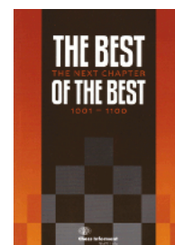
The Best of the Best: The Next Chapter by Chess Informant