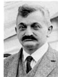
Emanuel Lasker December, 1927