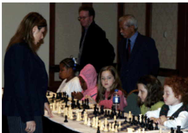
Susan Polgar with Florencio Campomanes in background