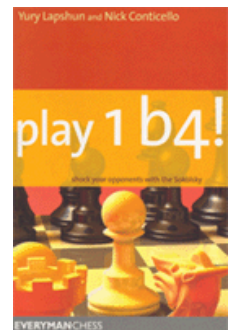
Play 1 b4! by Yury Lapshun & Nick Conticello