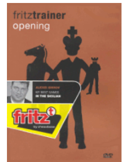
My Best Games in the Sicilian by Alexei Shirov