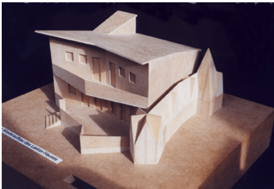
The characteristic mono-pitch roof in Bauhaus style

Both these initiatives helped in Autumn 2000 in applying for financial support for the conference. The Federal Agency for Civic Education granted two-third of the 100,000-mark budget (approx. $45,000 USD). The remaining third was provided by the minister in the Federal Chancellor's office for Cultural Affairs and Media, the Brandenburg regional agency for political education, the Moses Mendelssohn Center and the Wilhelm Fraenger Institute.