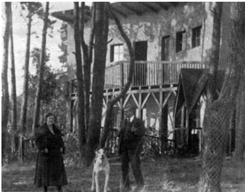
The only existing picture of Lasker and his wife Martha in front of their summer house. (Source Kagan's Neuste Schachnachrichten 1927, No. 1b)