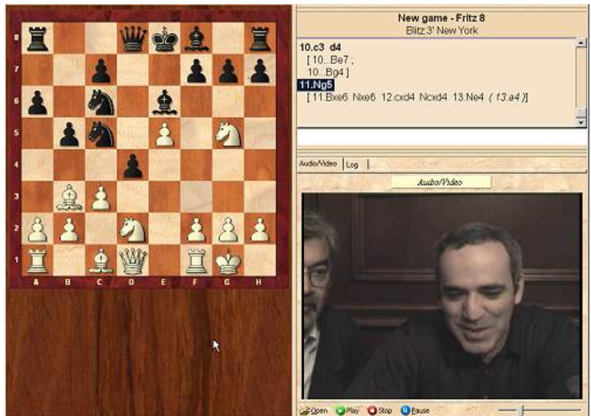
A personal lesson from Kasparov? No problem!

The Windows Media-based technology seems to be working well, although there have been the occasional hiccups. Most of the user questions stem from a familiar problem with ChessBase software, one that doesn't have much to do with the software. Yes, once again it's the lack of clear instructions. People who build things usually don't understand why people can't figure out how to use those things. This is why we have websites with lousy navigation, VCRs nobody can program, and, in the opposite direction, instructions on shampoo bottles.