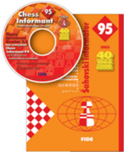
Informant 95 (CD) Only $5.95!