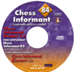
Informant 84 (CD) Only $5.95!

Visit Shop.ChessCafe.com for the largest selection of chess books, sets, and clocks in North America: