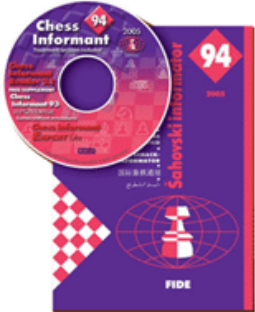
Informant 94 (CD) Only $5.95!