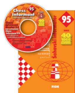
Informant 95 (CD) Only $5.95!