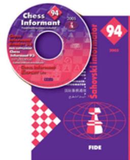
Informant 94 (CD) Only $5.95!