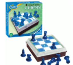
Solitaire Chess (Logic Game) Think Fun