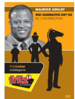
What Grandmasters Don't See, Vol. 2 by Maurice Ashley