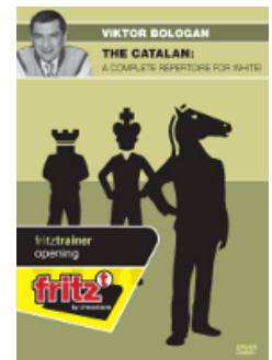
The Catalan by Viktor Bologan