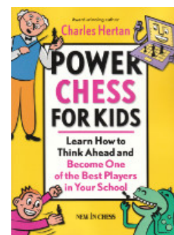
Power Chess for Kids by Charles Hertan