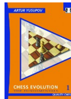
Chess Evolution 1: The Fundamentals by Artur Yusupov