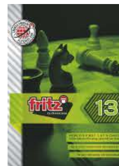
Fritz 13 by ChessBase

Purchases from our chess shop help keep ChessCafe.com freely accessible: