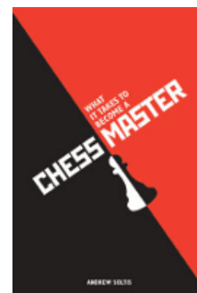
What It Takes to Become a Chess Master by Andrew Soltis

Purchases from our chess shop help keep ChessCafe.com freely accessible: