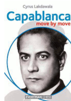
Capablanca: Move by Move by Cyrus Lakdawala