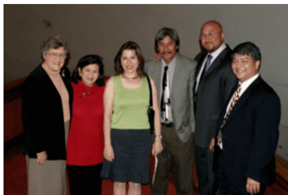
Susan Polgar with House Members