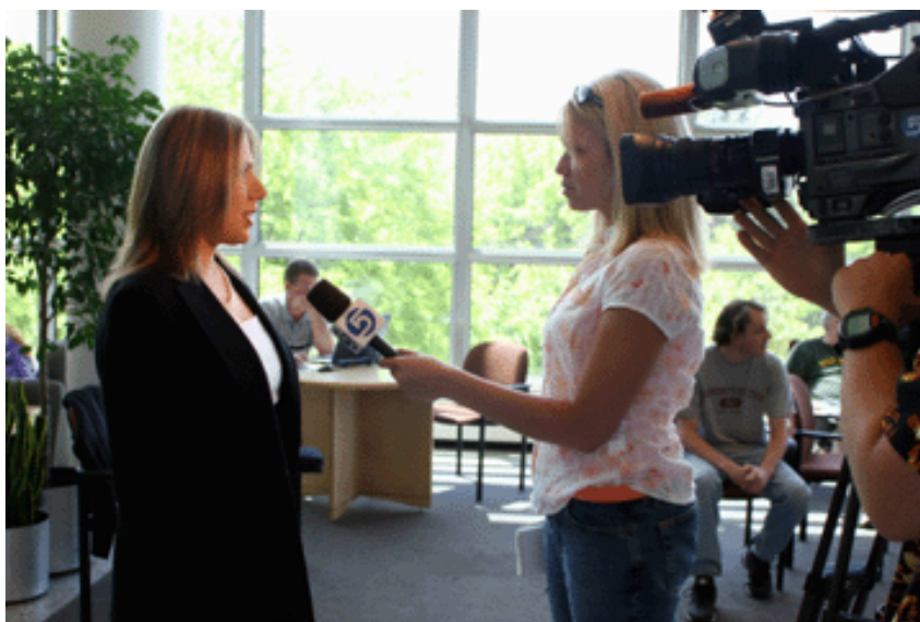
Press interview in Salt Lake City