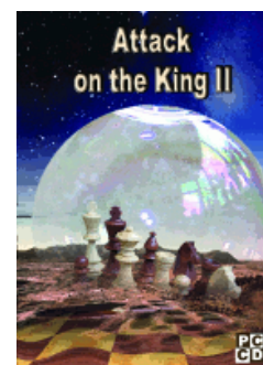
Attack on the King II by Convekta