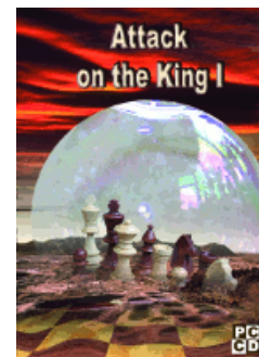
Attack on the King I by Convekta

Purchases from our shop help keep ChessCafe.com freely accessible: