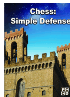
Chess: Simple Defense by Convekta

Free Shipping! On all Orders More than $75!