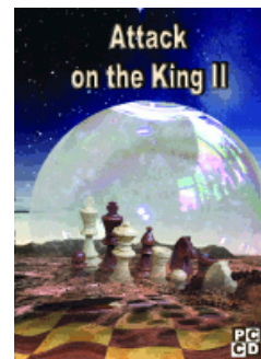
Attack on the King II by Convekta