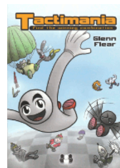
Tactimania by Glenn Flear

Purchases from our chess shop help keep ChessCafe.com freely accessible: