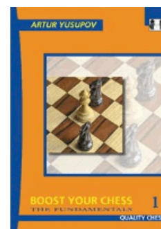
Boost Your Chess 1: The Fundamentals by Artur Yusupov