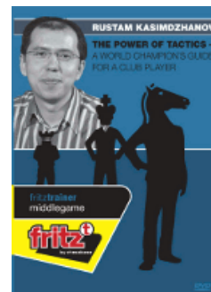
The Power of Tactics by Rustam Kasimdzhanov