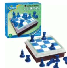
Solitaire Chess by ThinkFun

Purchases from our chess shop help keep ChessCafe.com freely accessible: