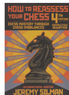
How to Reassess Your Chess by Jeremy Silman